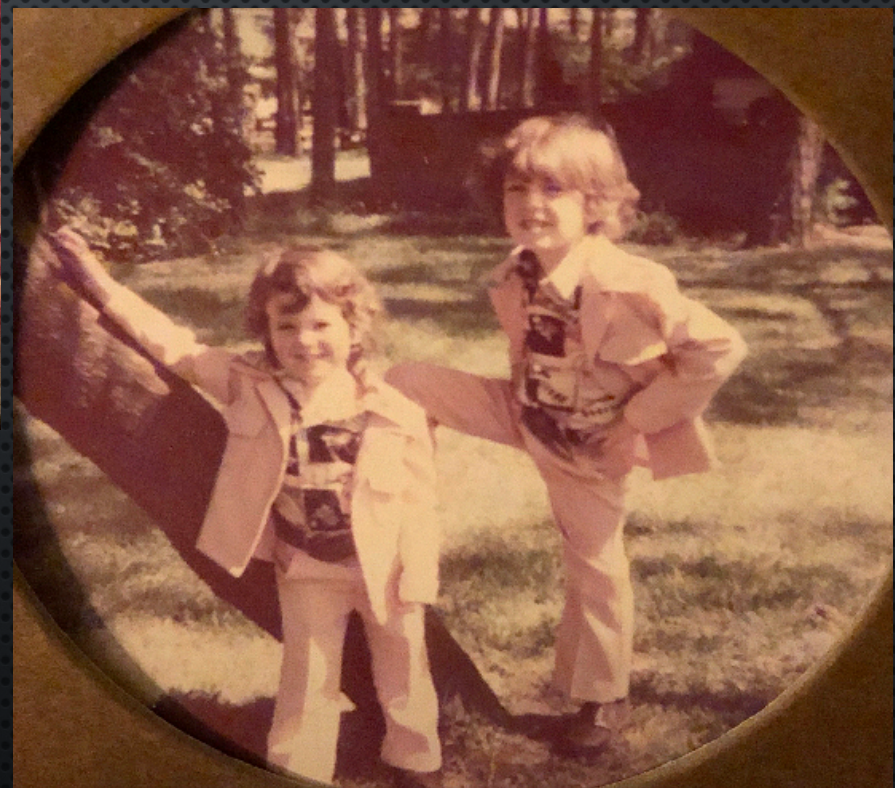
Pruitt Family Easter Pics